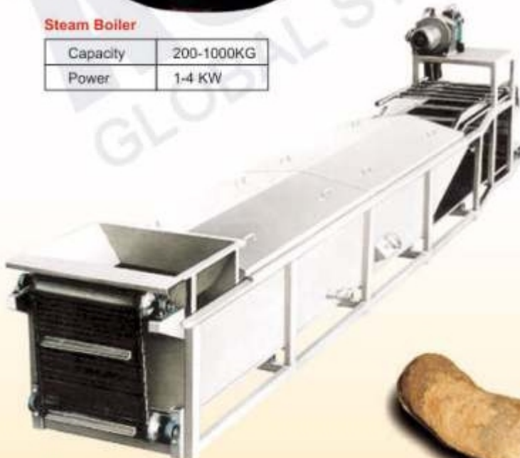
Blanching Machine (Batch Type)