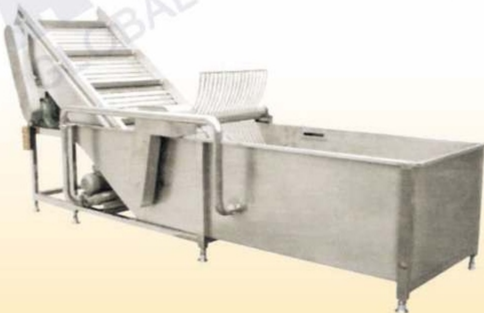
Automatic Washing Machine