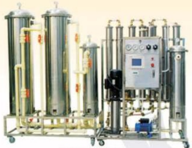
Water Treatment Plants