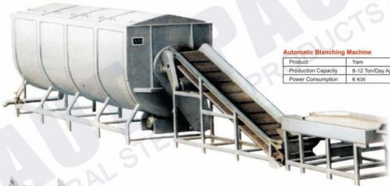
Automatic Blanching Machine