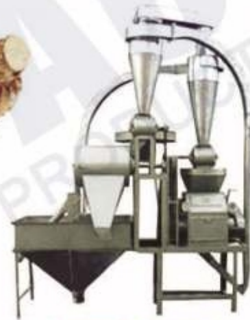
Pulverizer with Cyclon