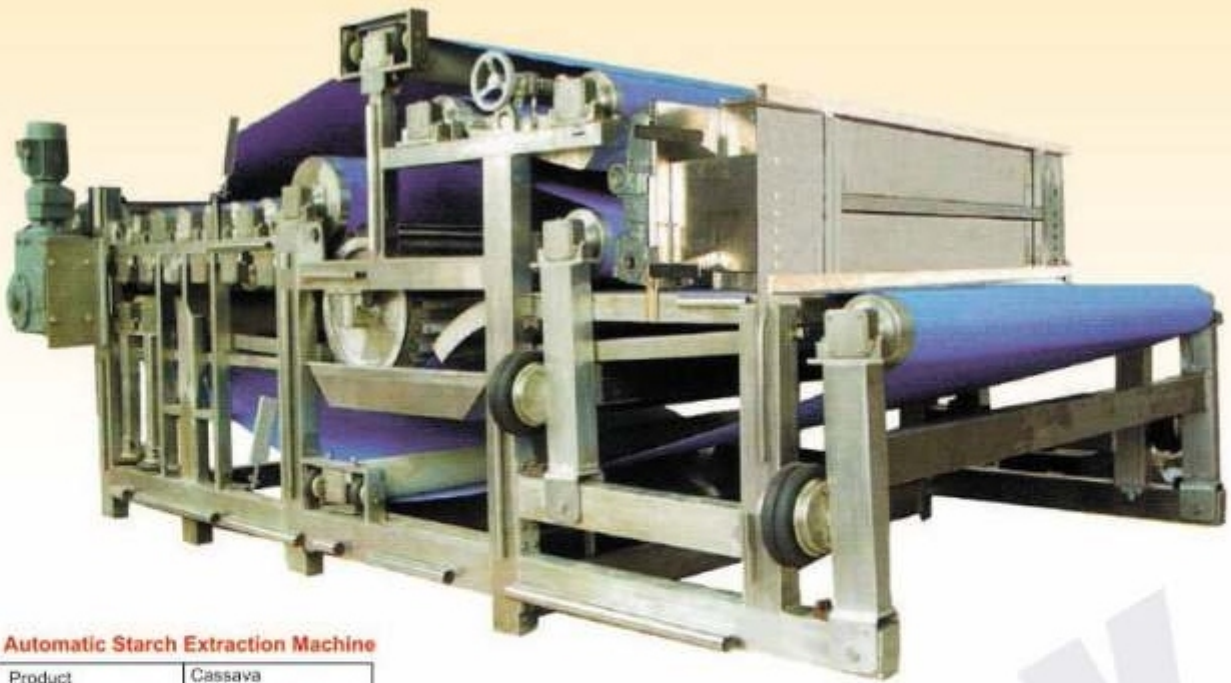
Automatic Starch Extraction Machine