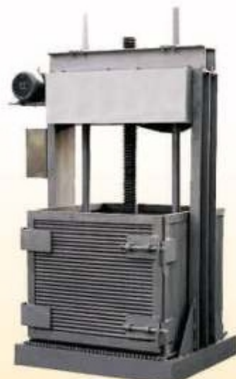
Starch Extraction (Semi Automatic)