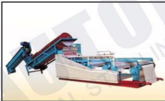
Cassava Pulverizing / Churning Machine