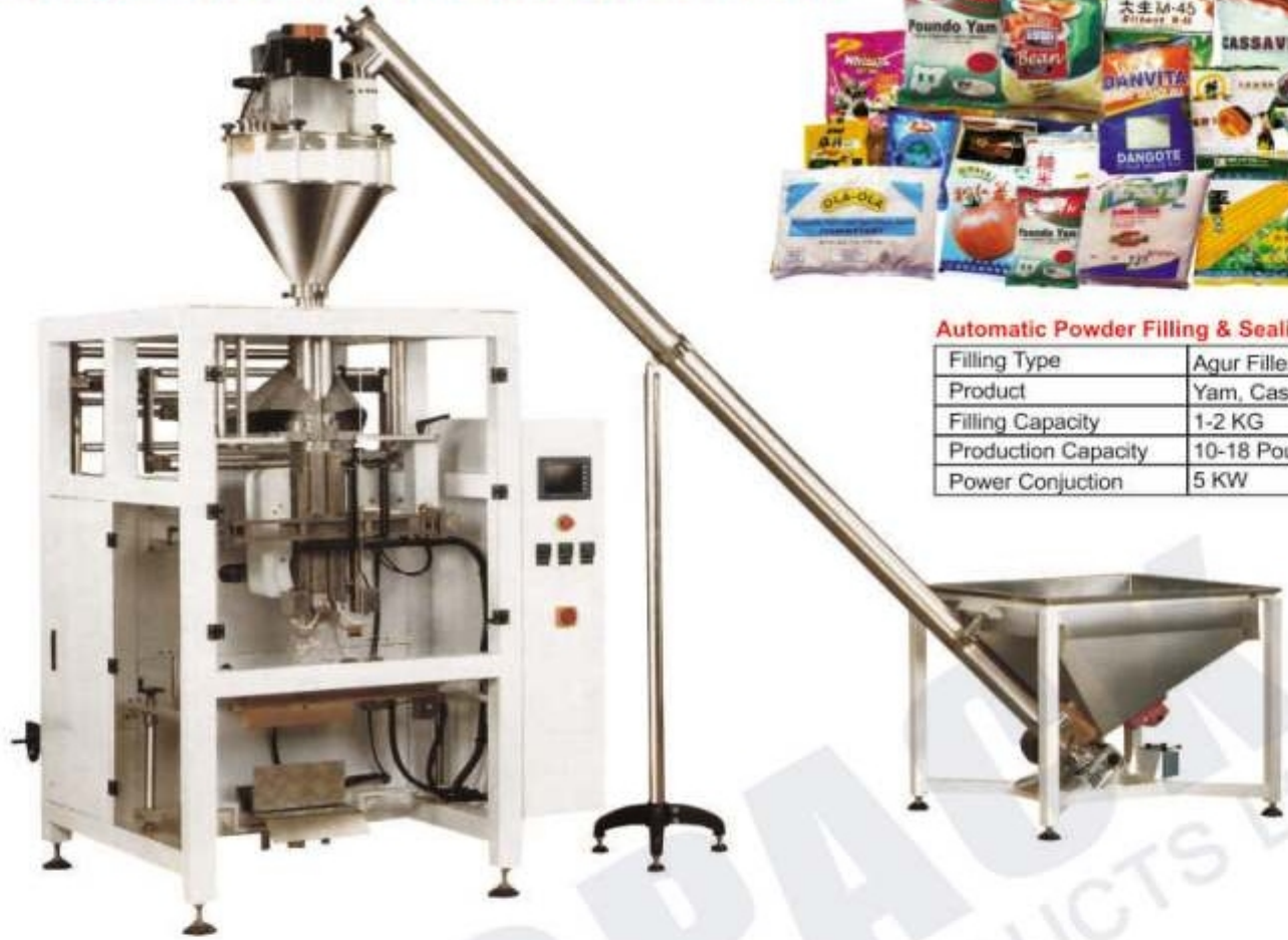
Automatic Powder Filling & Sealing Machine