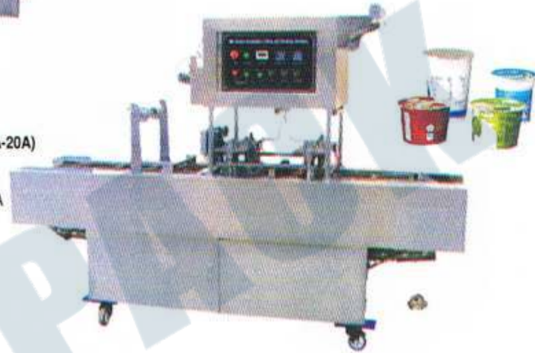
SEMI AUTOMATIC CUP FILLING & SEALING MACHINE (MRE-CFS-SA-20A)