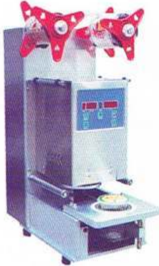
AUTOMATIC CUP SEALING MACHINE