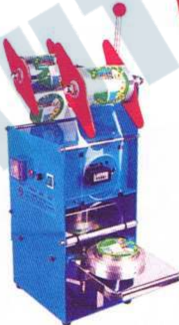
SEMI AUTOMATIC CUP SEALING MACHINE