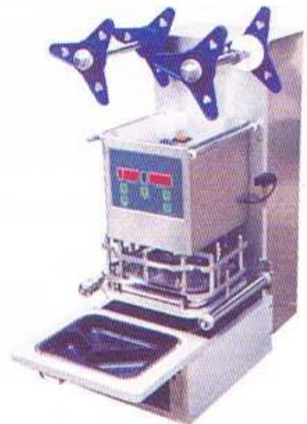
SEMI AUTOMATIC TRAY SEALING MACHINE