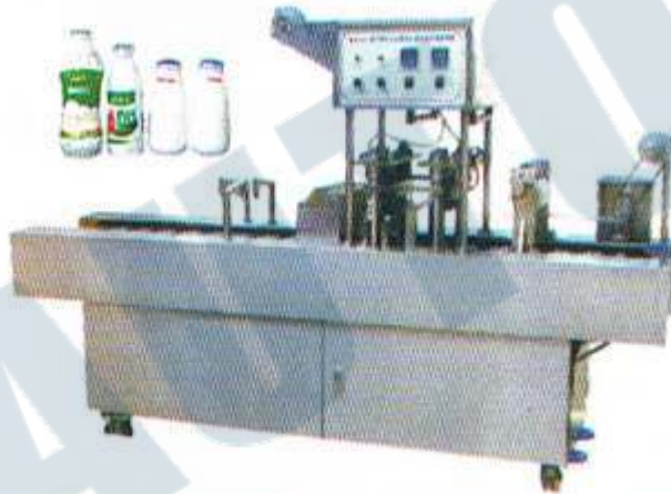
HDPE BOTTLE FILLING & SEALING MACHINE (MRE-BFS-FA-19)