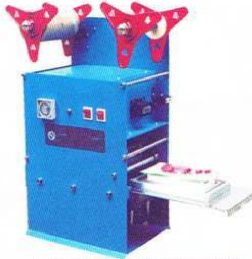
MANUAL TRAY SEALING MACHINE