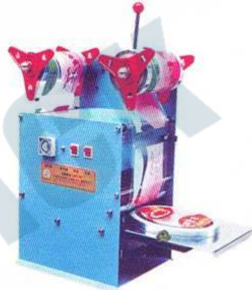
MANUAL CUP SEALING MACHINE