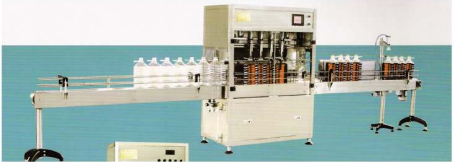
Linear Type Bottling Plant Big Capacity