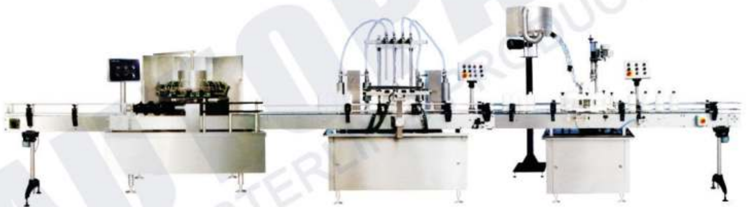
Automatic Linear Type Bottling Plant