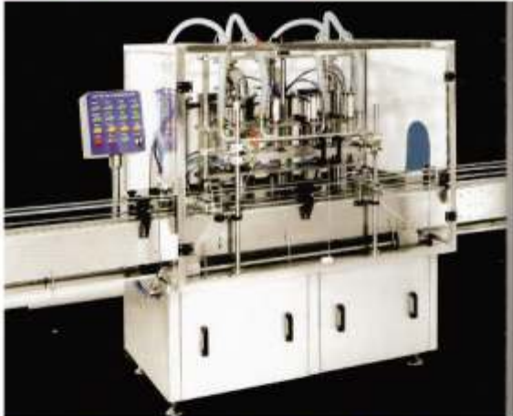
Linear Type Bottling Plant Big Capacity