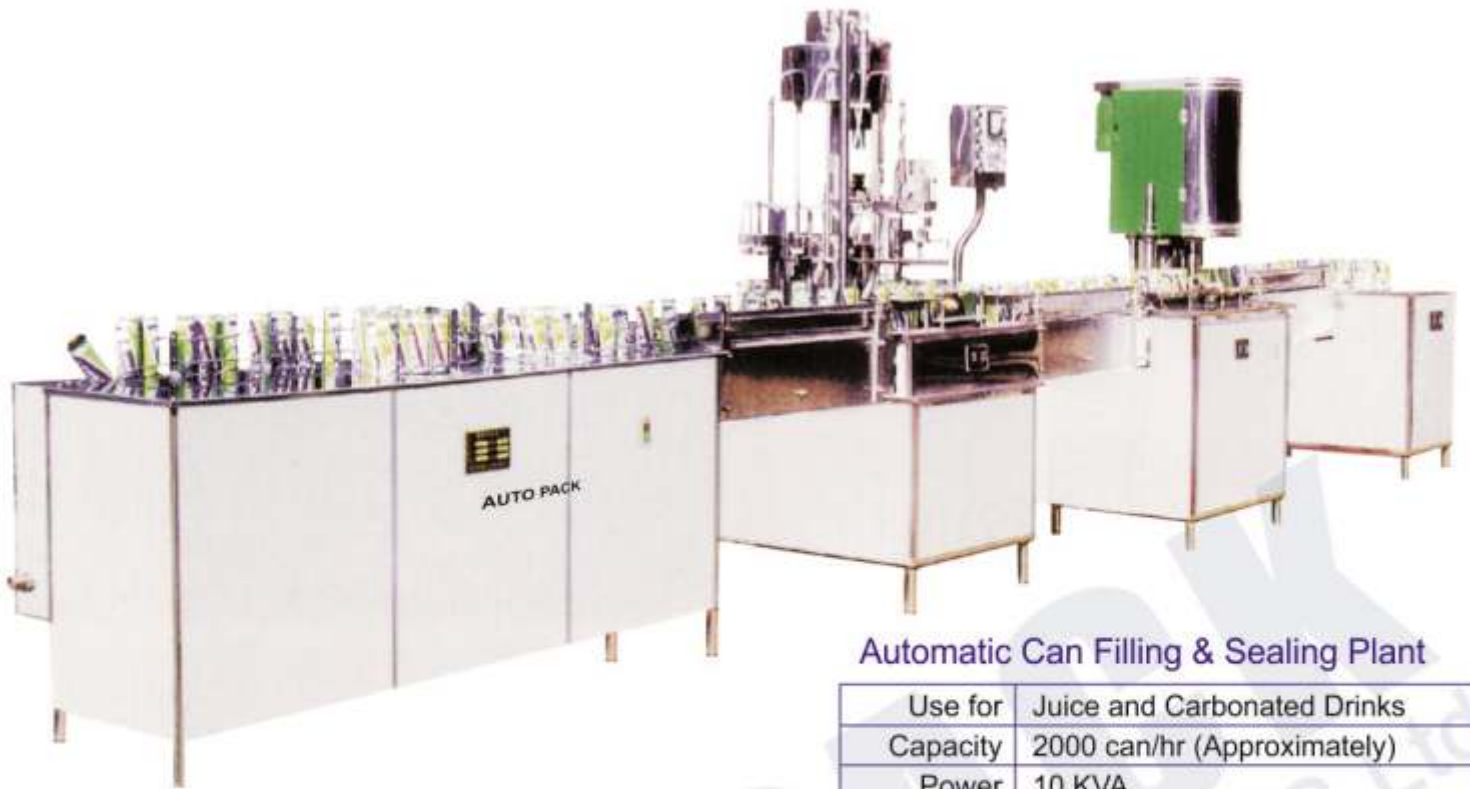
Automatic Can Filling & Sealing Plant