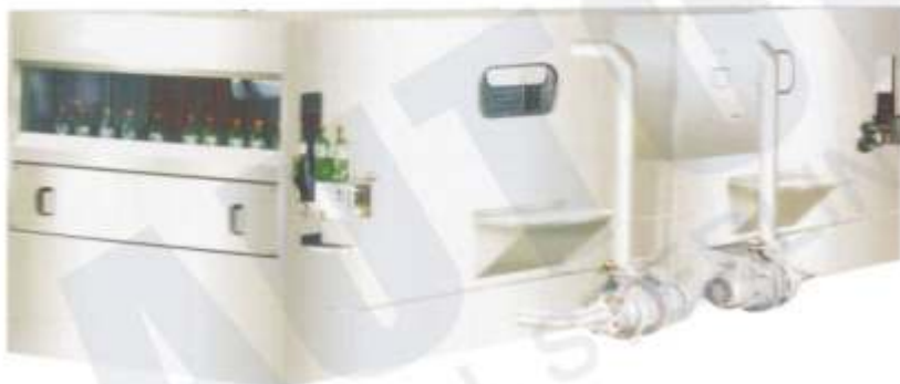
Automatic Cooling & Drying Conveyor