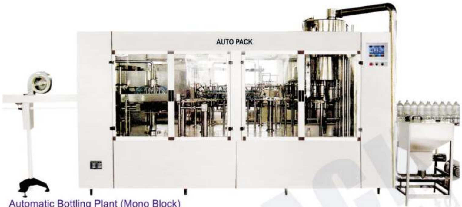
Automatic Bottling Plant (Mono Block)