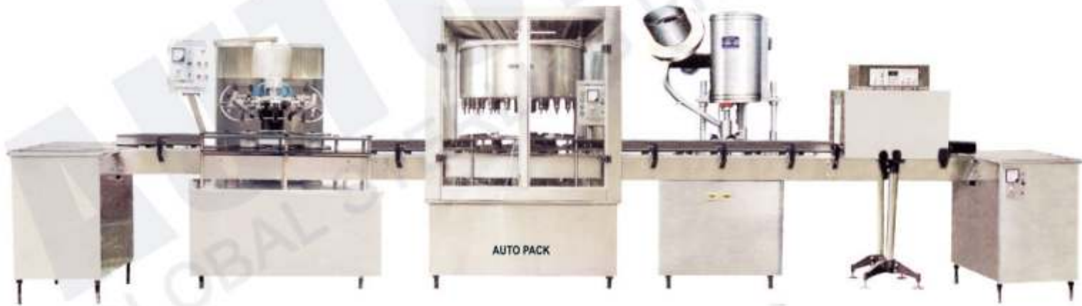
Automatic Bottling Plant (Standard Type)