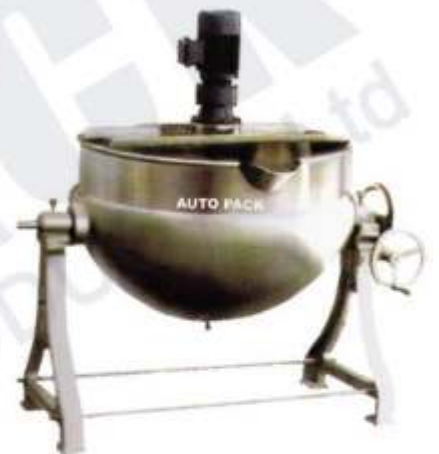
Double Jacketed Cooking Pan