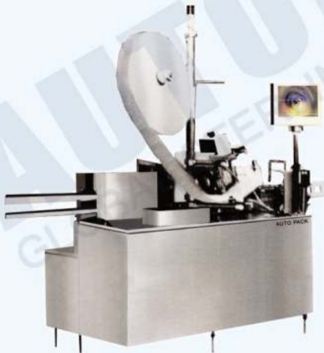
Automatic Straw Pasting Machine