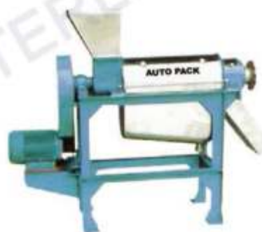
Fruit Juice Pulper