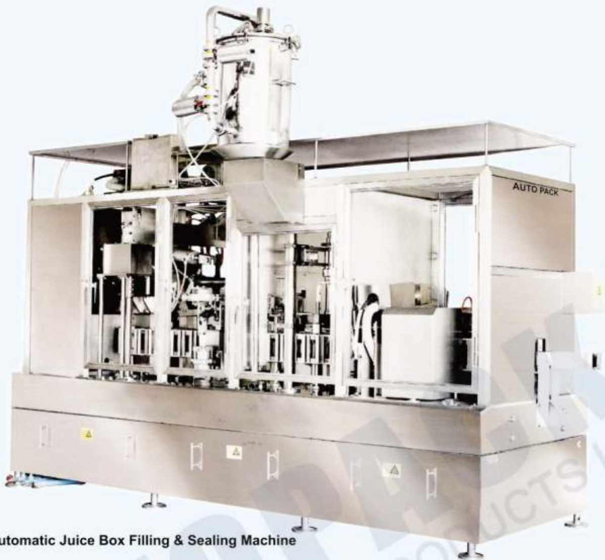
Semi Automatic Juice Box Filling & Sealing Machine