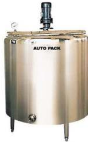
Heating / Cooling Tank