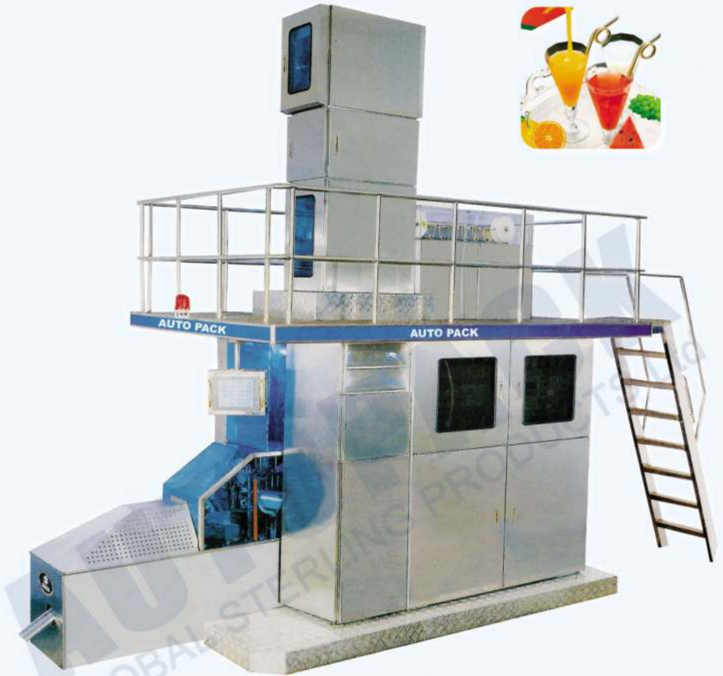
Automatic Juice & Yogurt in Laminated Box - Filling and Sealing Machine