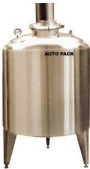
Sugar Dissolving & Mixing Tank