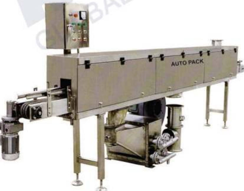
Cooling & Drying Conveyor