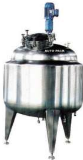
Pasteurizer / Triple Jacket Tank