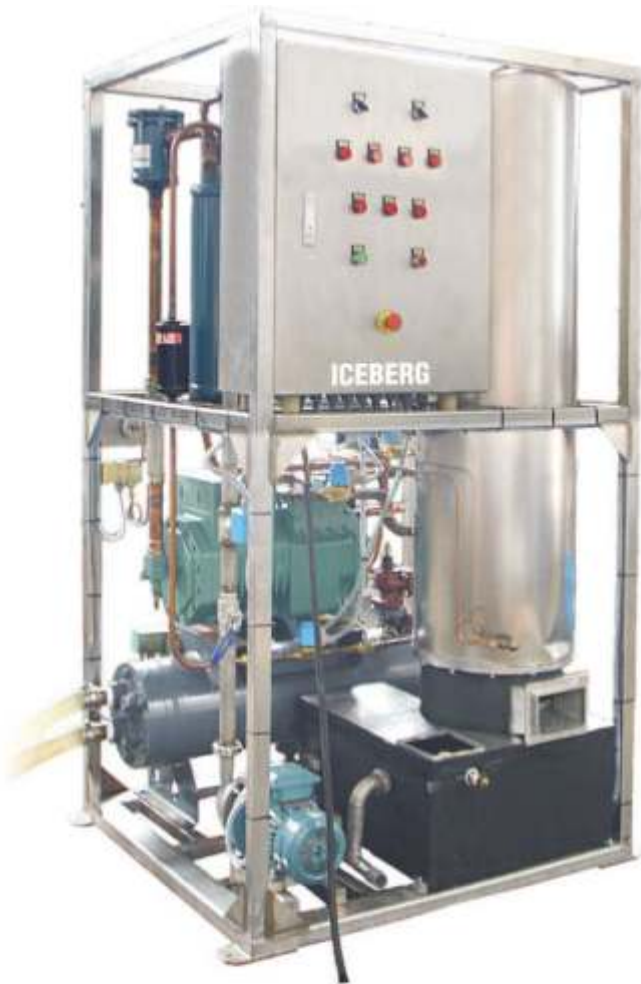
Automatic Tube Ice Machine