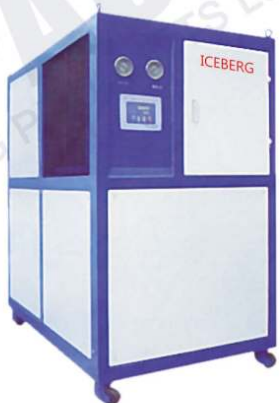
Industrial Chiller (available in various capacity)