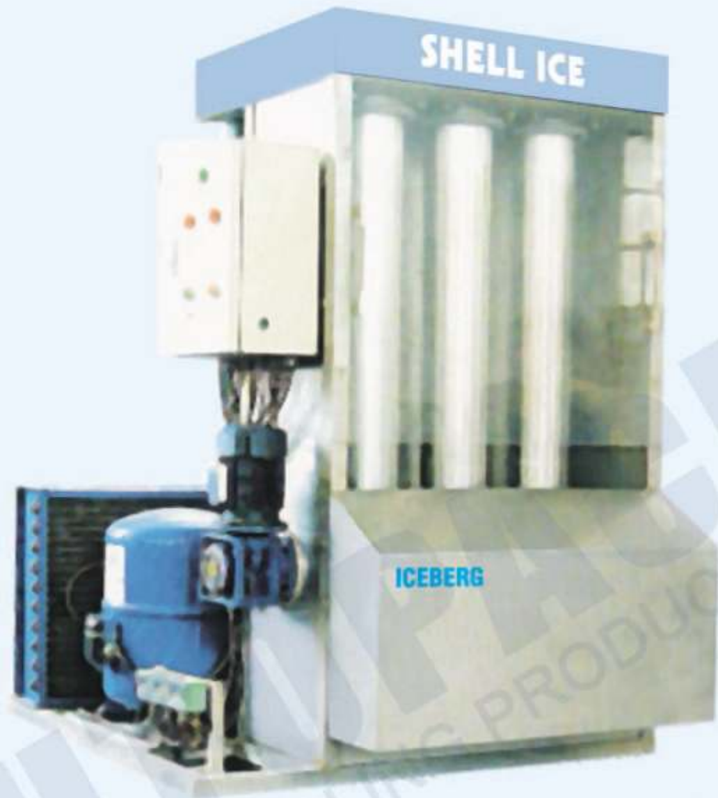
Automatic Shell Ice Machine