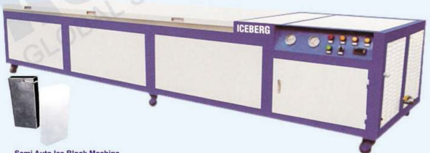
Semi Auto Ice Block Machine