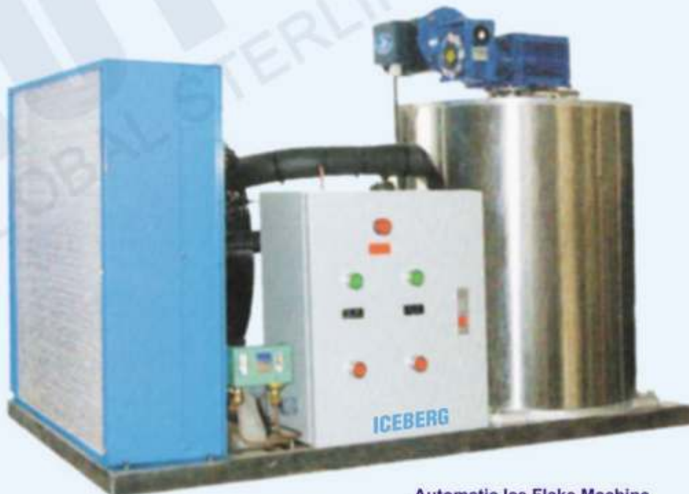
Automatic Ice Flake Machine