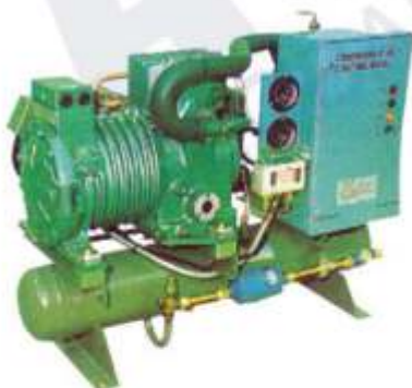
Heavy Duty Compressor