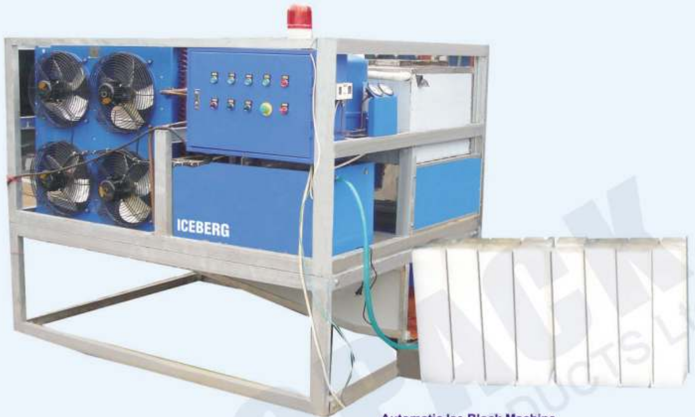
Automatic Ice Block Machine