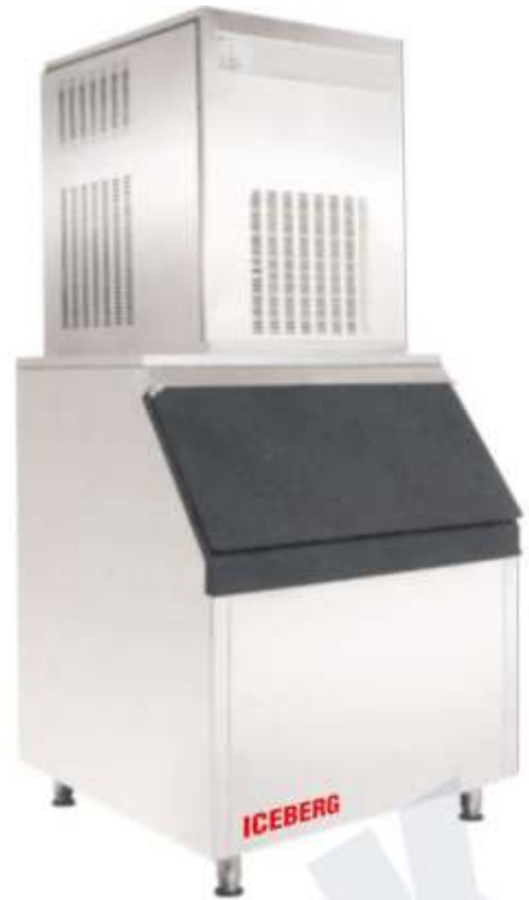
Automatic Ice Cube Machine